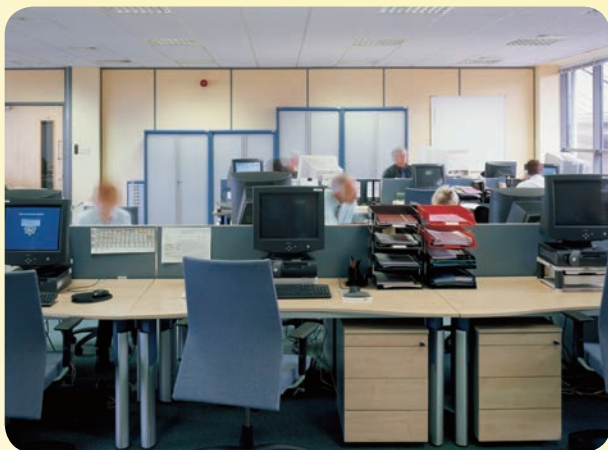
2) Police Station on King's Lynn Road