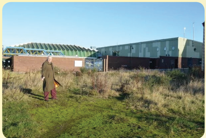
3 and 4) South eastern portion of car park and Southern portion of coach park, Southend Road