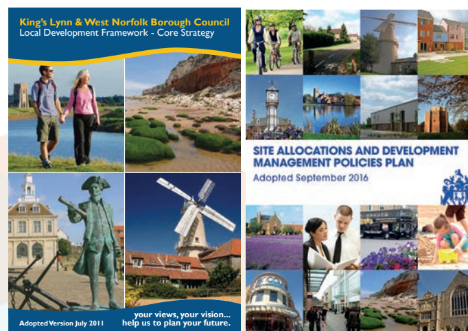
1) Core Strategy

Further details on the Local Plan and emerging plans are available on the Council's website: http://www.west-norfolk.gov.uk .