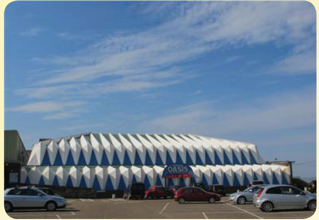
5) Land at Oasis Leisure Centre, Beach Terrace Road