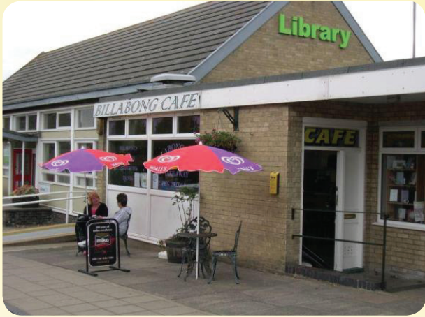
1) Library and Hunstanton Bus Station site, Westgate