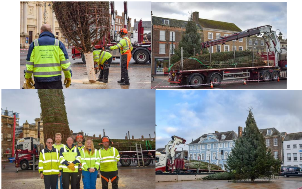
Please check our website for further information

The team are very busy this week with the preparation works ahead of this event.