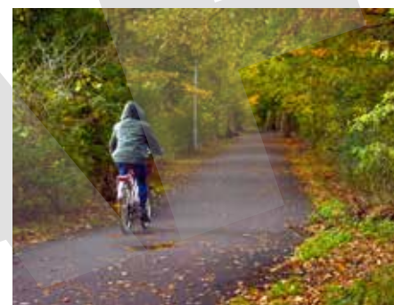
Cycleway, King's Lynn