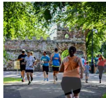
Park Run, The Walks