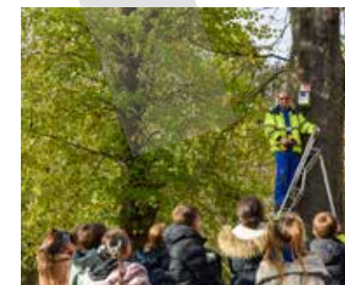
Installing Bird Boxes, The Walks