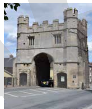
The South Gate, King's Lynn