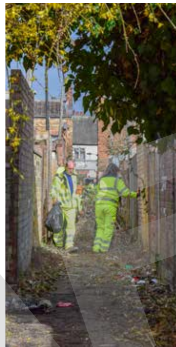
Clean-Up Team at Loke Road