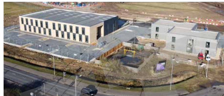
Enterprise Zone, King's Lynn