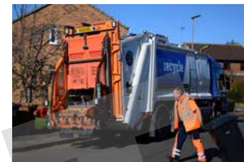
Refuse Bin Collection