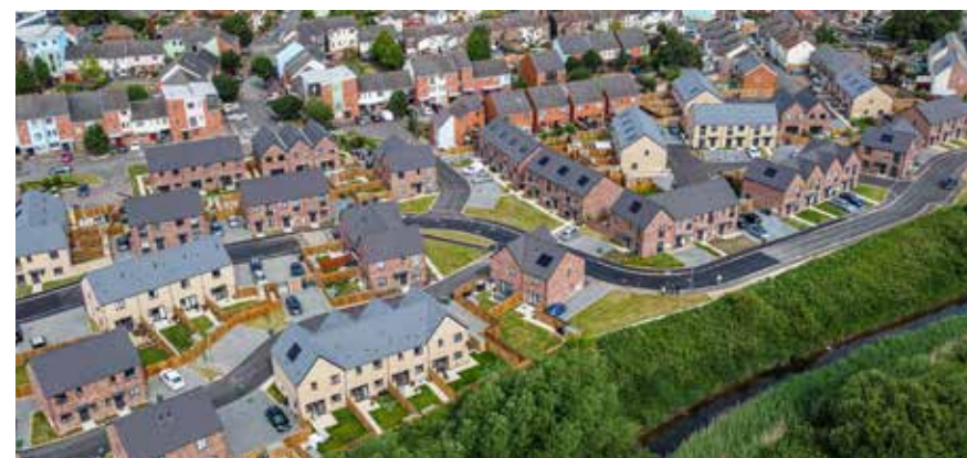
Nar Ouse Development, King's Lynn