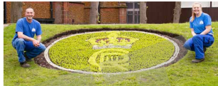
Coronation Badge Flowerbed, Tower Gardens