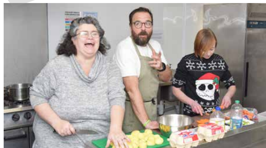
Food for Thought