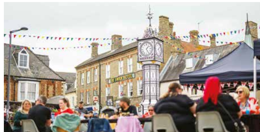
Community Event, Downham Market