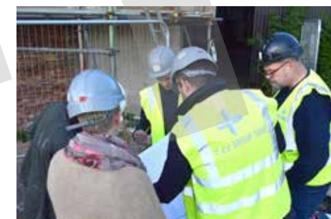
Sommerfeld & Thomas Building