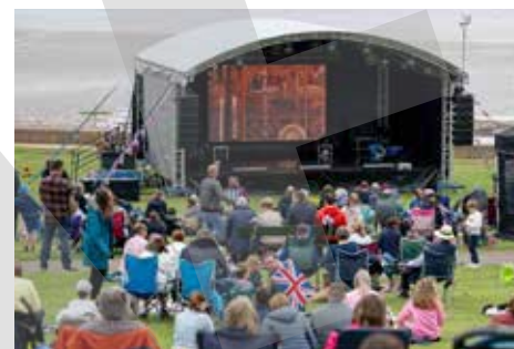
Community Event, Hunstanton