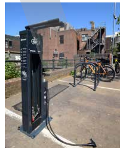
Baker Lane Active Travel Hub