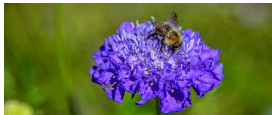
Wildflower and Pollinator Opportunities