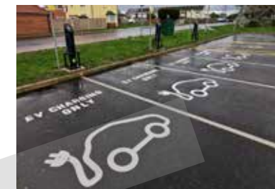
EV Chargers, Lynnsport