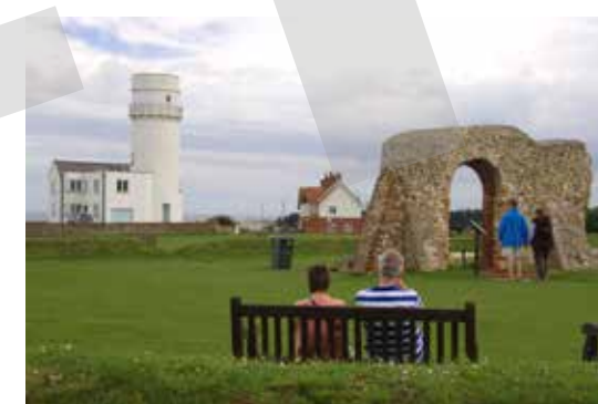
Old Hunstanton Lighthouse