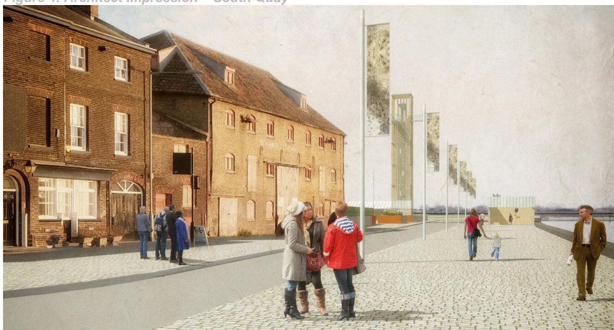
Figure 4: Architect Impression – South Quay

• South Quay - public realm improvements to enhance connectivity between Purfleet and Millfleet.