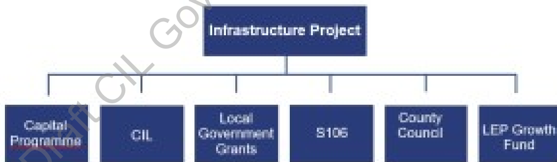
Figure 1 - Funding Streams

1.0.6 This document details the governance arrangements in place at the Borough Council of King's Lynn and West Norfolk, for the allocation and spending of CIL.