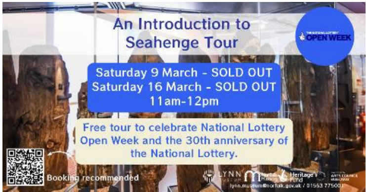
Publicity for the free Seahenge Tour offered at Lynn Museum in support of the National Lottery and as a thank you to lottery ticket holders