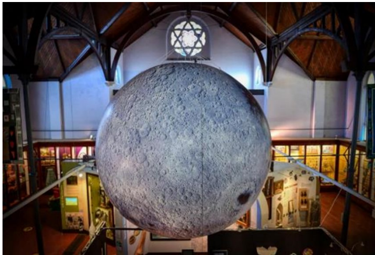
Model of the Moon on display at Lynn Museum

Museum in King's Lynn launches new moon exhibition which is free until the end of March (lynnnews.co.uk)