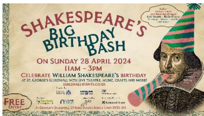
Publicity for event at St George's Guildhall supported by Norfolk Museums Service

The Lynn Museum free admission period started in October and ran until the end of March. This free admission period is provided under the terms of the Service Level Agreement (SLA) between the Borough Council and NMS.