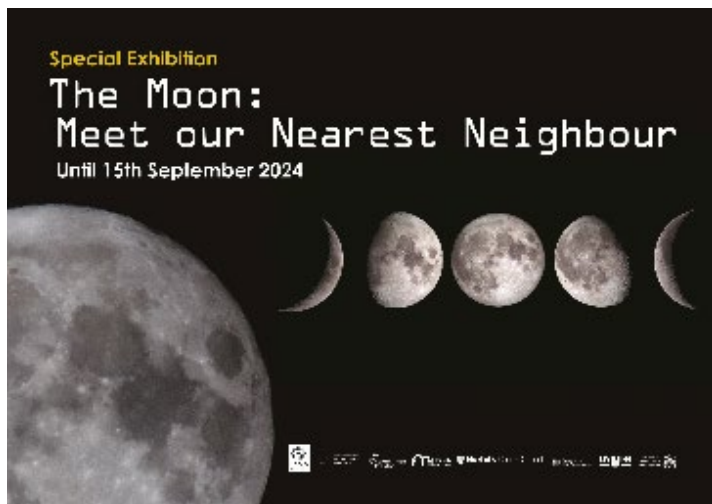
Publicity material for the Lynn Museum's current exhibition

This touring exhibition explores Earth's natural satellite – the moon. A key exhibit is a large moon model suspended above the exhibition, making use of the museum's high chapel ceilings. As part of the exhibition visitors have the opportunity to touch a real piece of moon rock. Other artefacts include ephemera from the 1969 moon landing. These displays, together with an associated programme of events and activities has been supported by a grant of £10,000 from the UK Shared Prosperity Funding for West Norfolk for arts cultural heritage and creative activities administered by the Borough Council of King's Lynn & West Norfolk.