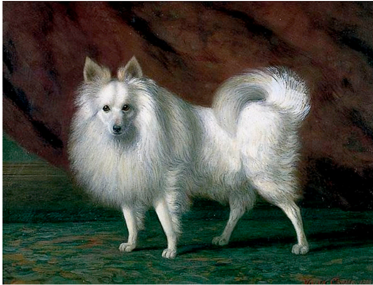
The White Dog by Vivian Crome, shortlisted for display in Woof!

The exhibition will be aimed at a family audience, with an emphasis on objects rather than text. The themes of Woof! include: