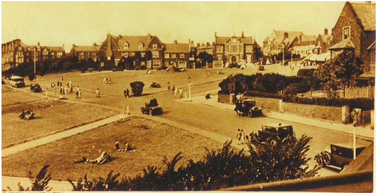
The Green before 1914

Hunstanton St. Edmund's is 1 mile south of the village of Hunstanton and forms part of the same parish. It is a rising watering place situated at the southern end of the cliff the terminus of the Lynn and Hunstanton Railway and distant 144 miles from London. The land is owned by Hamon Le Strange, who offers it to the public on building leases for a long term of years, and since the opening of the railway in 1862 a number of good houses, first, second and third class, have been erected . . . [and] a church has been built in which Divine service is performed, though the building is not completed.